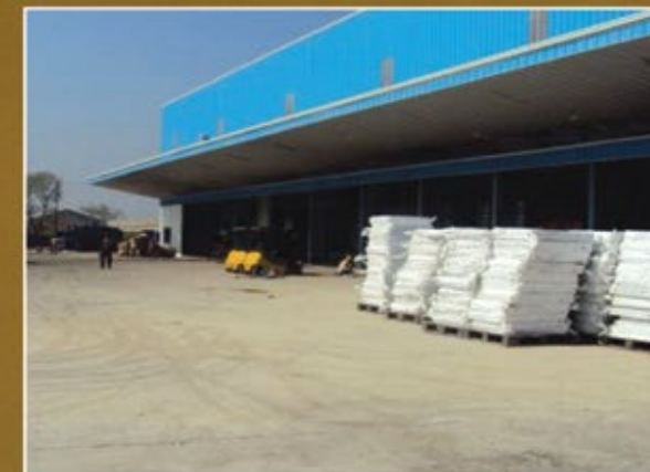
PEPSICO INDIA HOLDINGS PVT. LTD. (Bazpur - Uttarakhand)