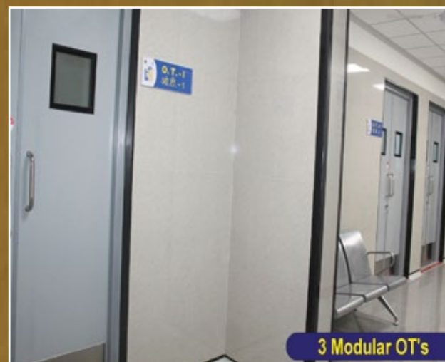
LIONS EYE HOSPITAL - MODULAR OT (Aurangabad - Maharashtra)