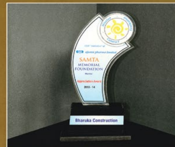
Ajanta Pharma Limited Appreciation Award