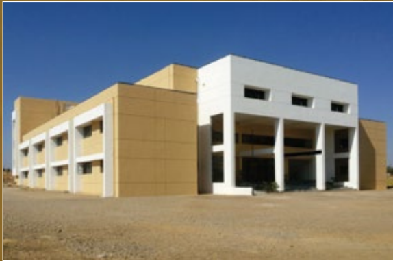
PADMASHRI DR BARWALE SCHOOL - Mandwa (MHYCO Seeds Company (Jalna – Maharashtra)