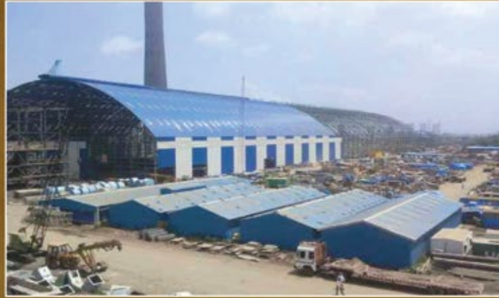
RELIANCE INDUSTRIES LTD. (Dahej - Gujarat) through ThyssenKrupp Industries India Pvt. Ltd.

We feel privileged and honored to be recognized for our commitment to safety and team efforts