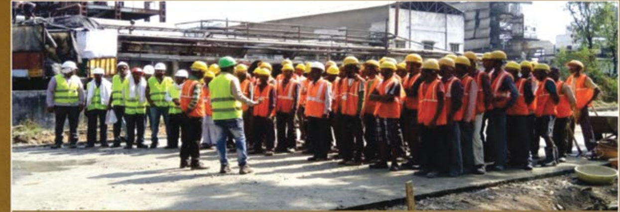
Boiler House & Allied Civil Works