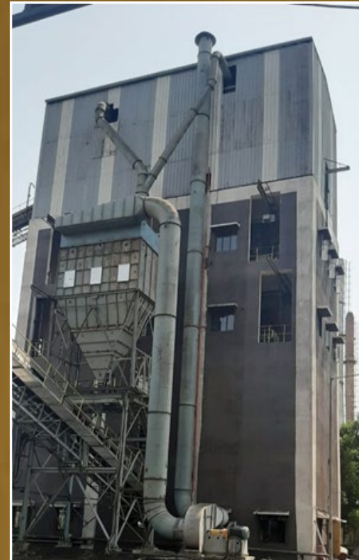
MEGHMANI FINE CHEM LTD. (DAHEJ - GUJARAT)