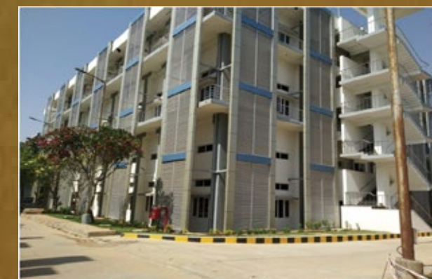
HINDUSTAN AERONAUTICS LTD (Bangalore - Karnataka)