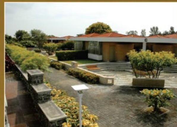
THE MEADOWS RESORT (Aurangabad - Maharashtra)