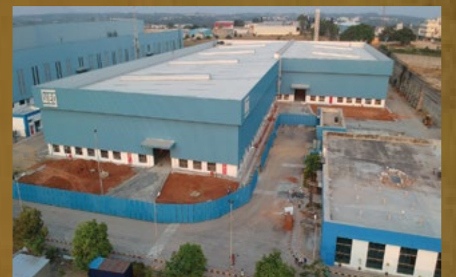
WEG INDUSTRIES LTD. (Hosur - T.N.)