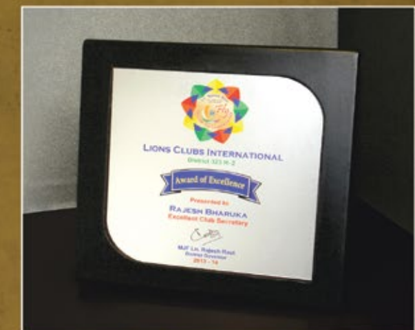
Lions Clubs International Award of Excellence