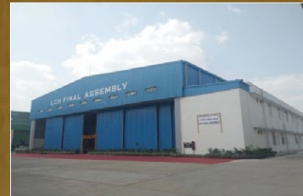
HINDUSTAN AERONAUTICS LTD (Bangalore - Karnataka)