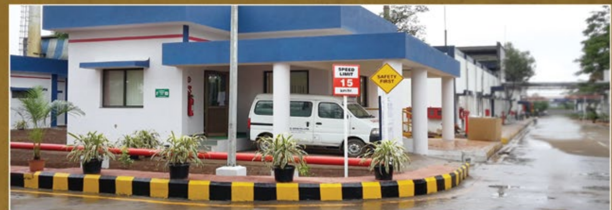
UNITED SPIRITS LTD. (Nashik - Maharashtra)