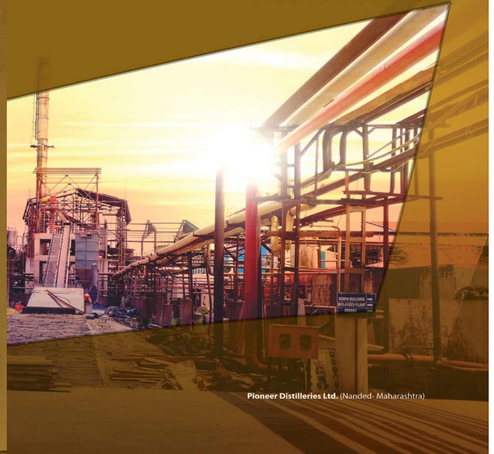
Pioneer Distilleries Ltd. (Nanded- Maharashtra)

TRANSPARENCY, RELIABILITY & INTEGRITY IS COMPANY'S MOTO