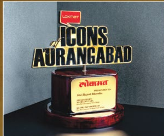
Lokmat Icons of Aurangabad presented by Mr Ratan Tata