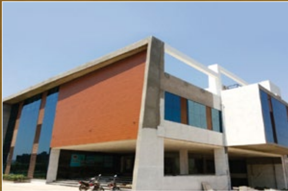
INDIAN INSTITUTE OF CHARTERED ACCOUNTANTS (Aurangabad - Maharashtra)