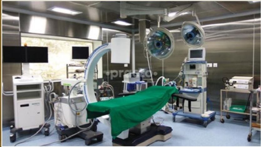
KRUPAMAYI HOSPITAL - OT (Aurangabad - Maharashtra)