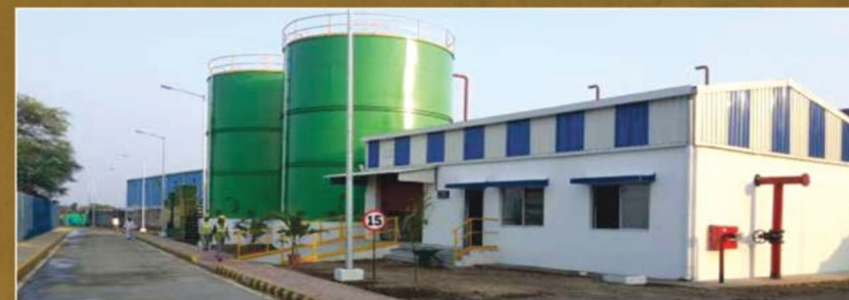
UNITED SPIRITS LTD. (Bhopal - Madhya Pradesh)