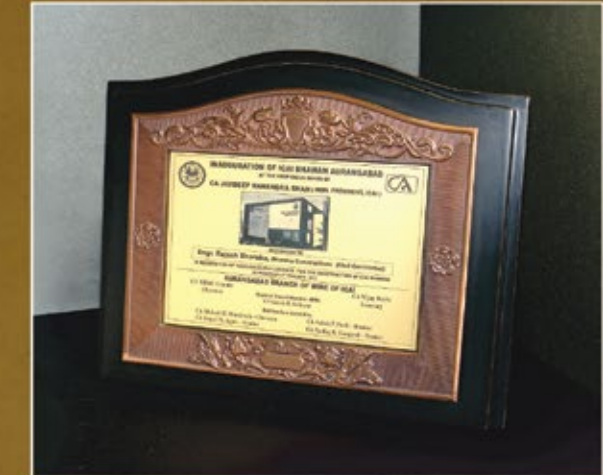
ICAI Recognition Award