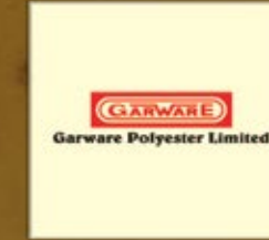
Garware Polyester Limited