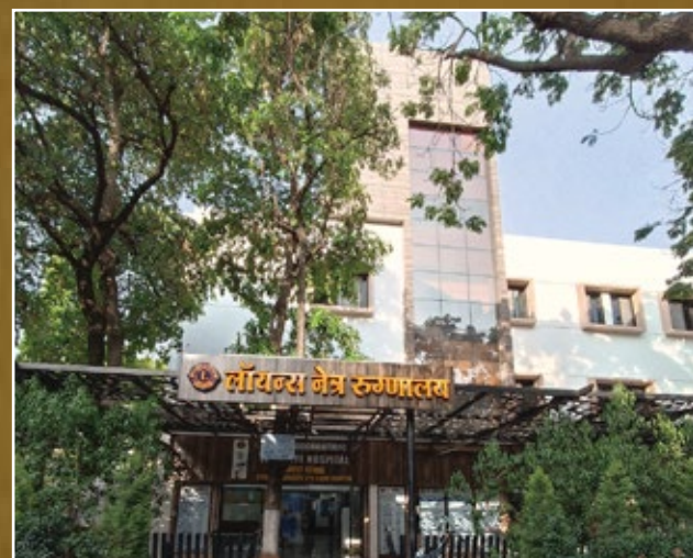
LIONS EYE HOSPITAL - ELEVATION (Aurangabad - Maharashtra)