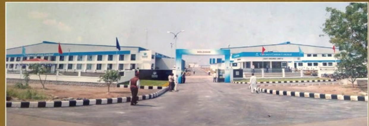
GREAVES COTTON LTD. (Aurangabad - Maharashtra)