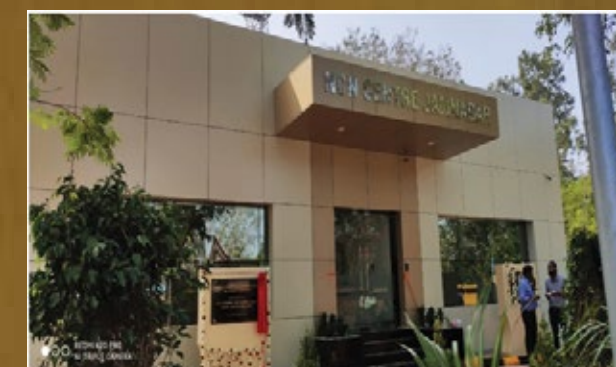
STL VARUN (Jamnagar - Gujarat)