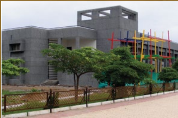
GOLDEN JUBILEE SCHOOL – JALNA (MHYCO Seeds Company (Jalna – Maharashtra)