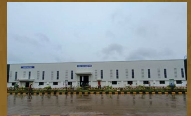
ATG TIRES PVT. LTD. (Vizag-A.P.)