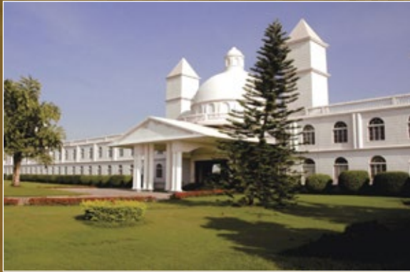
CAMBRIDGE SCHOOL (Aurangabad - Maharashtra)