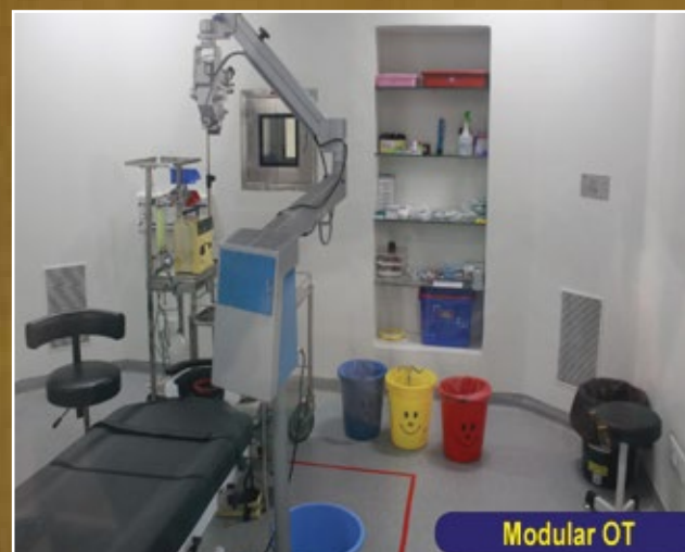
LIONS EYE HOSPITAL - MODULAR OT (Aurangabad - Maharashtra)