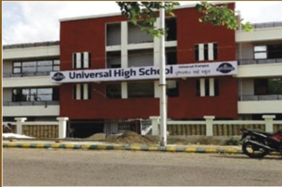
UNIVERSAL HIGH SCHOOL (Aurangabad - Maharashtra)