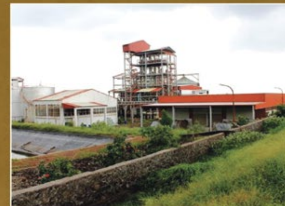
RADICO NV DISTILLERIES LTD. (Aurangabad - Maharashtra)