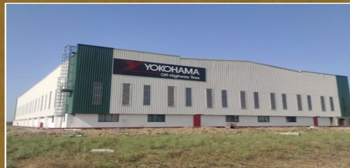
ALLIANCE TIRE GROUP (DAHEJ - GUJARAT)