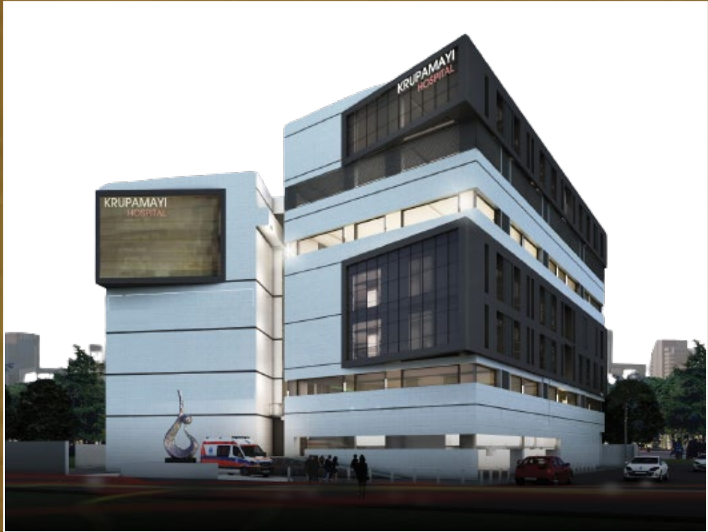
KRUPAMAYI HOSPITAL - ELEVATION (Aurangabad - Maharashtra)