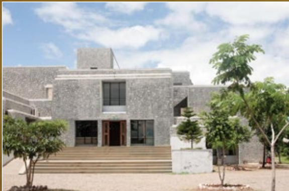
TATA INSTITUTE OF SOCIAL SCIENCE (Tuljapur - Maharashtra)