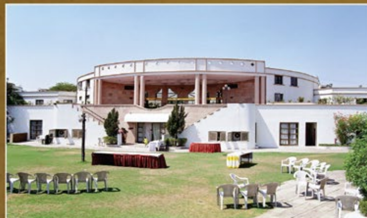
HOTEL PRESIDENT PARK (Aurangabad - Maharashtra)