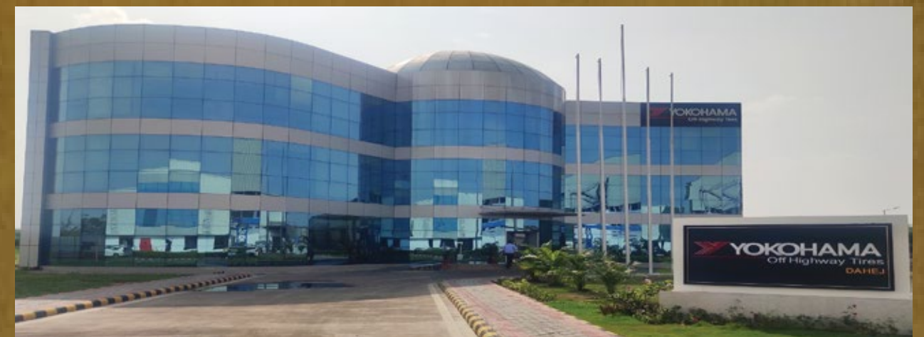
ATG TIRES PVT. LTD. (Dahej - Gujarat)