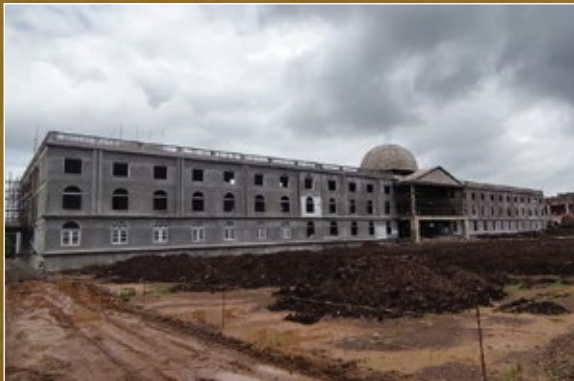
INTERNATIONAL SCHOOL (Nasik – Maharashtra)