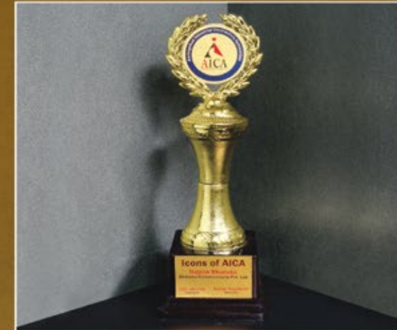
Icons of AICA