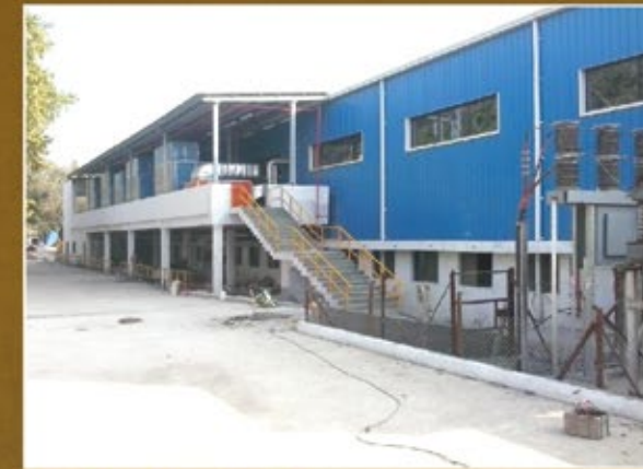
NRB BEARINGS LTD. (Aurangabad - Maharashtra)