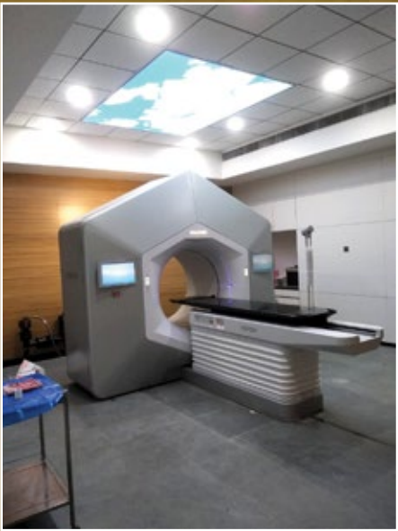
KRUPAMAYI HOSPITAL - LINAC UNIT (Aurangabad - Maharashtra)