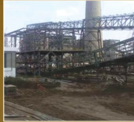
Fuel and Limestone handling for Captive Power Plant