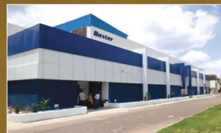
BAXTER INDIA PRIVATE LTD. (Aurangabad - Maharashtra)