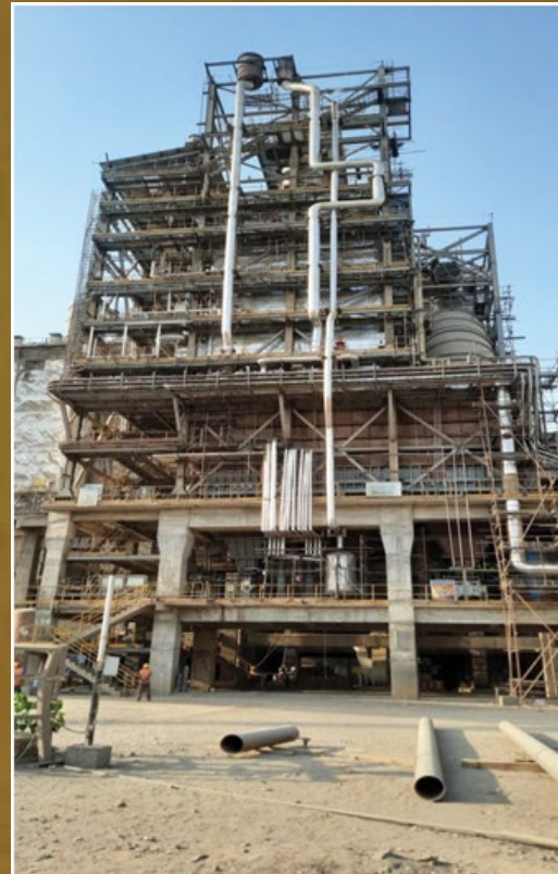
ULTRATECH CEMENT LTD., (Bela - M.P.)