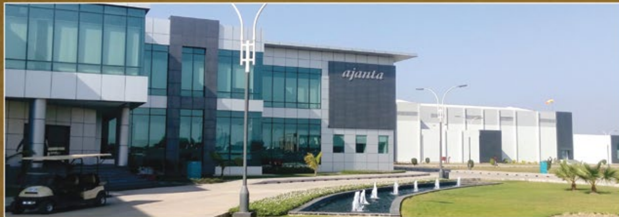
AJANTA PHARMA LTD. (Dahej - Gujarat)