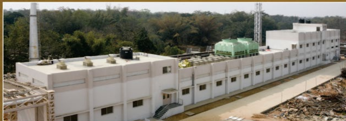
AJANTA PHARMA LTD. (Guwahati - Assam)