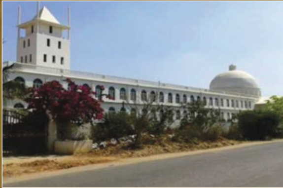
ST.XAVIERS SCHOOL (Bengaluru – Karnataka)