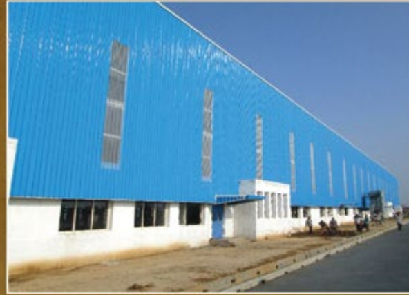
DASHMESH MECHANICAL WORKS (Amargarh - Punjab)