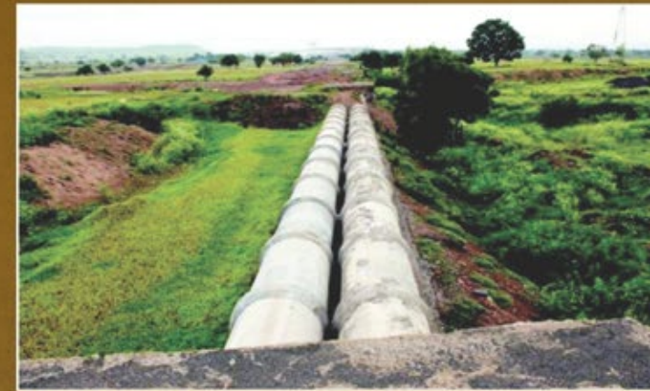
APIL INFRASTRUCTURAL PROJECTS (Aurangabad- Maharashtra)