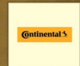
Continental Tyres India Pvt. Ltd.