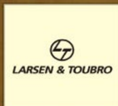
Larsen & Toubro