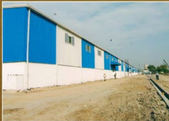
TATA CHEMICALS LTD. (Babrula - Uttar Pradesh)