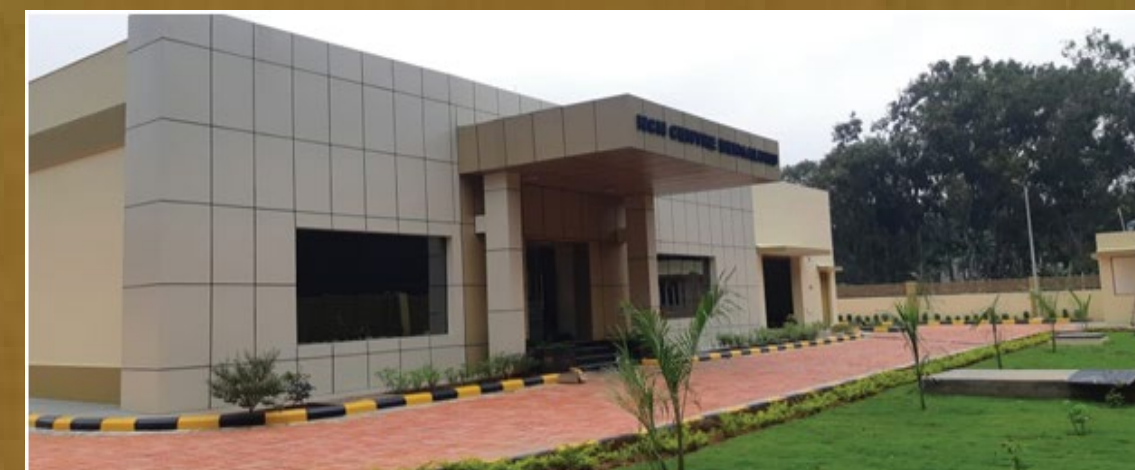
STL VARUN (Bangalore - Karnataka)