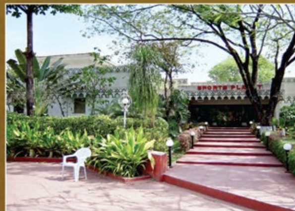
HOTEL AJANTHA AMBASSADOR (Aurangabad - Maharashtra)