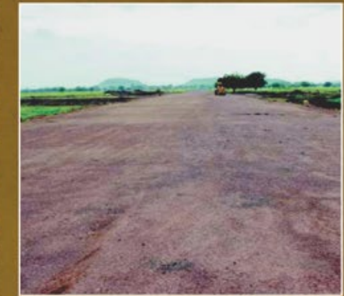
Road Nallah Diversion