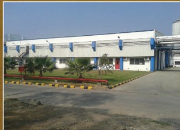
SAB MILLER BREWERIES LTD. (Aurangabad - Maharashtra)