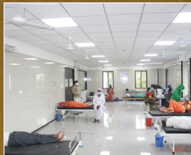
LIONS EYE HOSPITAL - GENERAL WARD (Aurangabad - Maharashtra)