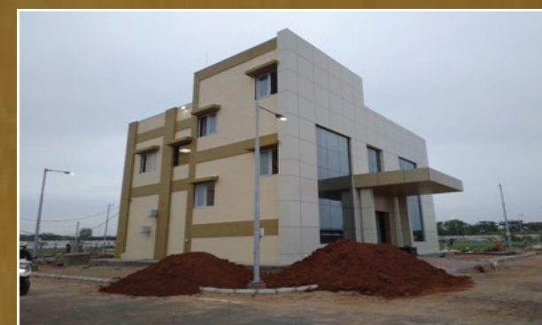
STL VARUN (Chennai - Tamilnadu)