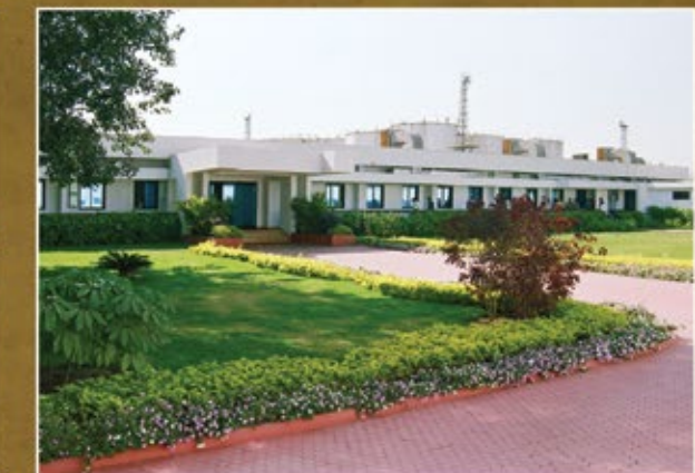
GARWARE POLYESTER LTD. (Aurangabad - Maharashtra)