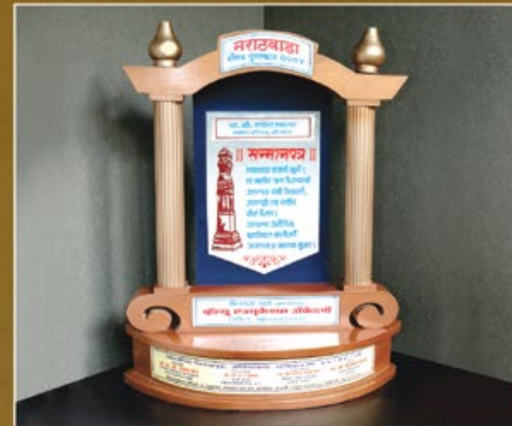
Marathwada Gaurav Puraskar