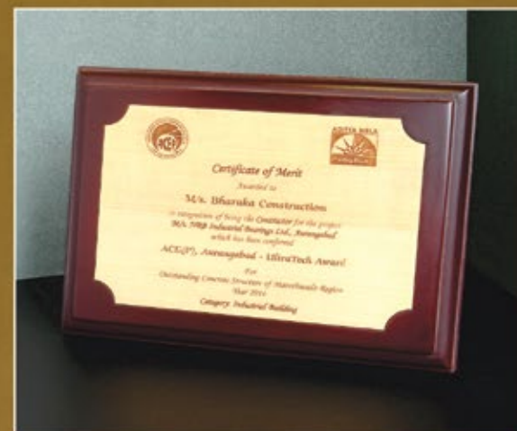
ACE(P), Aurangabad - Ultratech Award