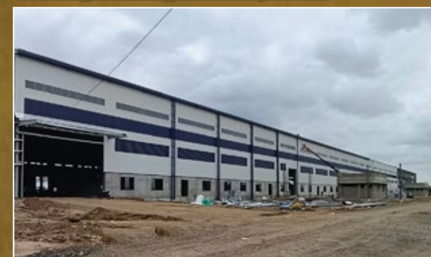
TECHNOCRAFT FORMWORKS PVT. LTD. (Aurangabad - Maharashtra)