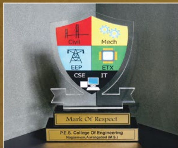
Memento from P.E.S. College of Engineering