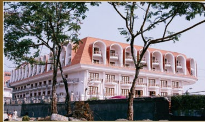
AURANGABAD GYMKHANA CLUB (Aurangabad - Maharashtra)