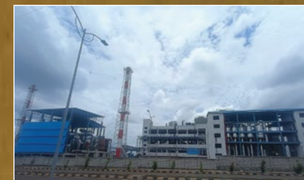
ORIC ORGANICS CHEMICAL PVT. LTD. (Aurangabad - Maharashtra)